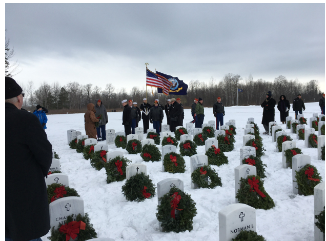
Wreaths across America Sampson Park

The FY 2017 NDAA also included a provision that would allow dependents of retired members to purchase hearing aids at-cost. MOAA is working closely with DoD's TRICARE department on the details of this benefit and likely will have updates in a few months.