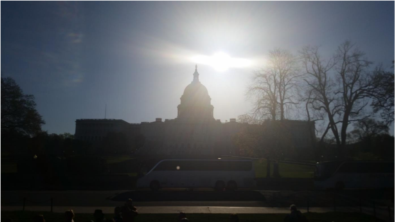
Sun rises over the Capital