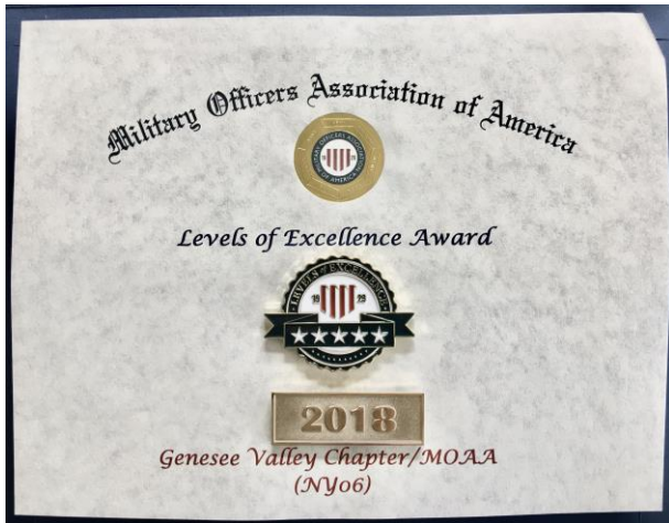
MOAA 5-Star Levels of Excellence Award, GVC's Ninth Consecutive Year!