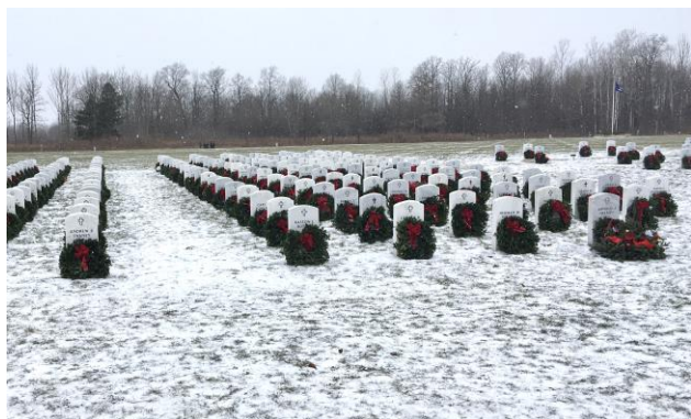
Sampson Veterans Memorial Cemetery

Saturday, December 14, 2019 Wreath laying begins at 10:30 am Ceremony begins at 12:00 pm Sampson Veterans Memorial Cemetery (NYSVMC) 6632 New York Route 96a Romulus, NY 14541