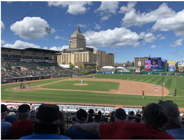
GVC Day at a Red Wings Game!