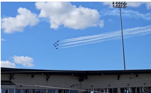
GVC Red Wings Game & an Air Show Too!

As you can see in the pictures, the sunshine and light, puffy clouds were a perfect backdrop for both the Red Wings game and an impromptu Air Show for attendees!!!