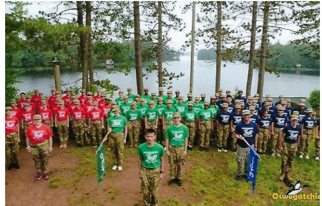
JROTC Cadets at Camp Oswegatchie

you to all who supported these cadets, enabling them to attend summer camp.