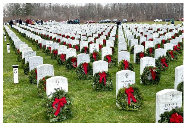
Wreaths Across America Day, Dec 16, 2023 NYS Veterans Cemetery - Finger Lakes

Wreaths Across America Day 2024 will be held on Saturday December 14, 2024, please mark your calendars now.