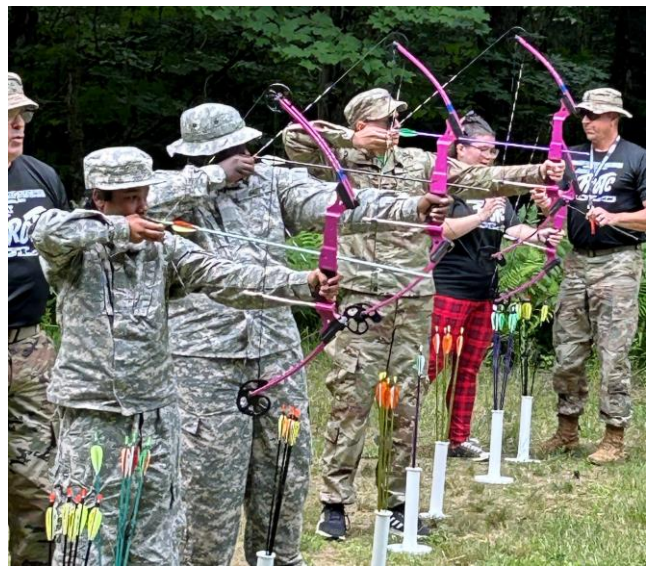
JROTC 2024 Archery Skills Training