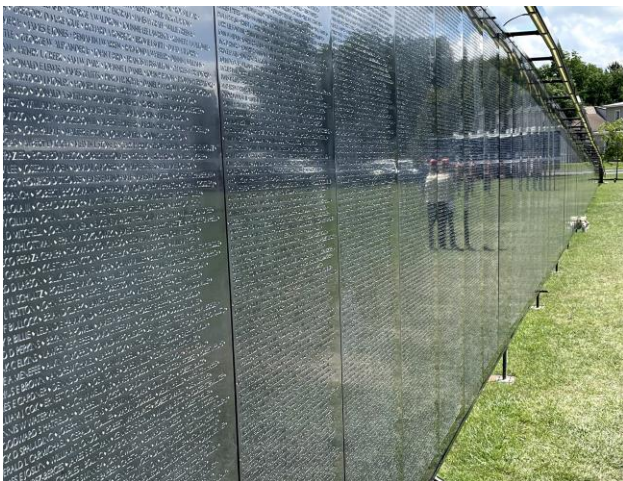
Almost all of "The Wall that Heals" East Wall

As you may know, "The Wall that Heals," is a ¾ size replica of the Vietnam Veterans Memorial, with over 58,000 individual service members names on The Wall. The Vietnam Veterans Memorial seems more personal to me than all the others because of all the individual names listed on each of the panels of the wall.