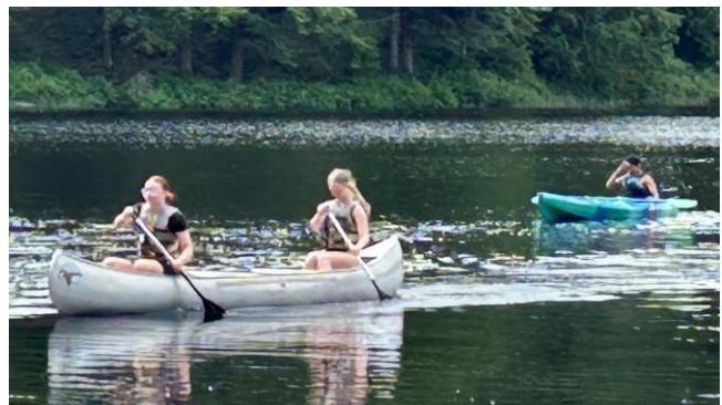
JROTC 2024 Canoeing and Kayaking