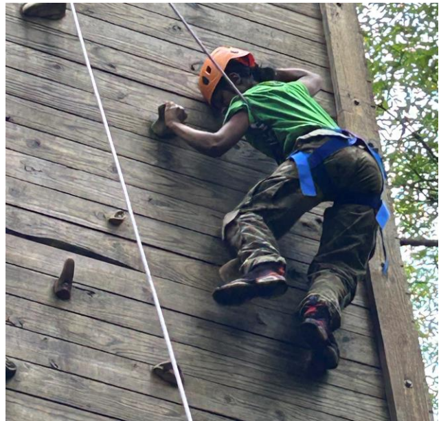
JROTC 2024 Rock Wall Challenge