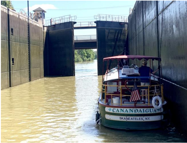
The Riverie Passing Through Lock 33

The chapter's 2024 summer cruise was on the Riverie, sailing the Genesee River through Lock 33 in Rochester, and was enjoyed by all who went! Highlights included transiting Lock 33, some fantastic lunches and the weather was absolutely fabulous, barely a cloud in the sky!