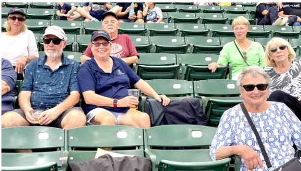
Most of the "Usual Suspects" of GVC!

It wasn't looking good; the forecast was mostly rain all during gametime. But the Weather Gods showed us some mercy and oh what a beautiful day it turned out to be. A smaller group than normal, but we were part of the 7,594 attendees at the game and had a fantastic time.