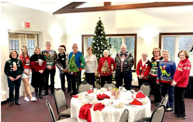
Ugly Holiday Sweaters were out in full-force at the GVC Holiday Party in December!

In addition to the Holiday Dinner, our winter clothing drive for the Veterans Outreach Center was a great success as well, filling three large plastic bags with new winter clothing items, such as hats, gloves, socks, t-shirts, underwear and such, which was delivered to the VOC. The generosity of GVC members is always so heartening, knowing the items will support veterans in a time of need.