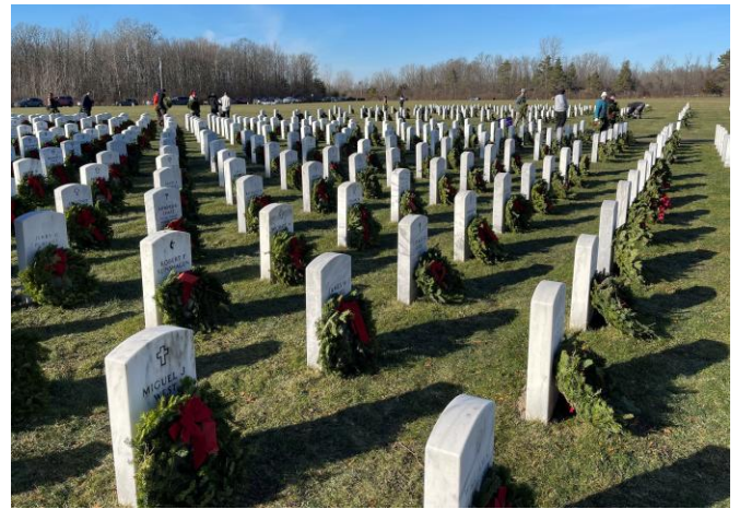
Wreaths Across America Day, Dec 14, 2024 NYS Veterans Cemetery – Finger Lakes

Our Wreaths Across America campaign was very successful, with nearly 185 wreaths sponsored in GVC's name. And although it was a cold day, the Sun was out, and it was a beautiful day to Honor veterans and their family members laid to rest at the cemeteries the chapter sponsors wreaths for. We are truly grateful for the very generous sponsorship of wreaths toward our campaign.